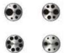
Interchangeable Inserts (as per requirement)